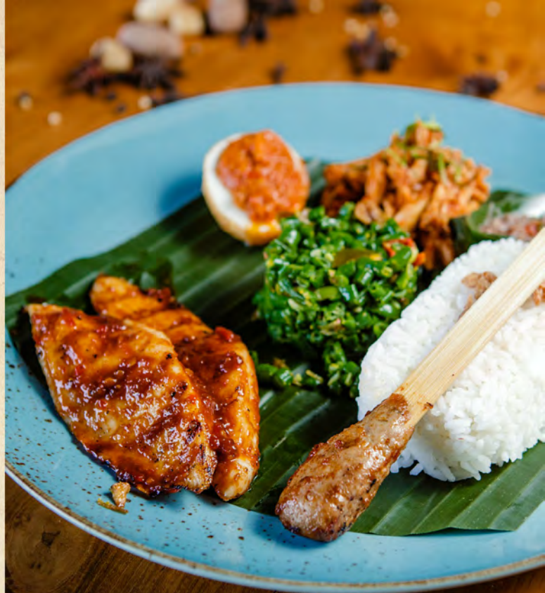
NASI CAMPUR TAMBLINGAN

Asian cuisine is a characteristic style of cooking practices and traditions, usually associated with a specific culture. Asia, being the largest and most populous continent, is home to many cultures, many of which have their own characteristic cuisine.