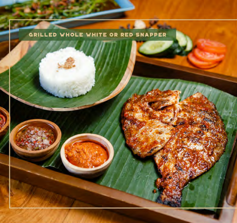
GRILLED WHOLE WHITE OR RED SNAPPER