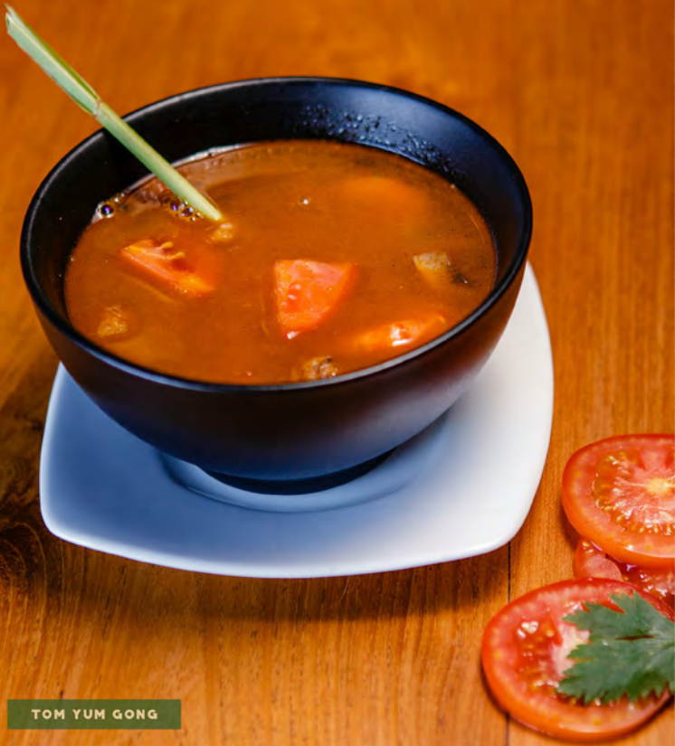
TOM YUM GONG