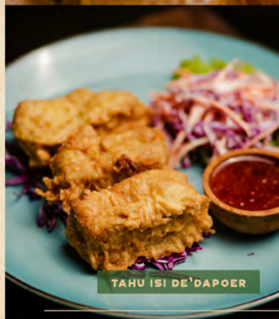
TAHU ISI DE'DAPOER