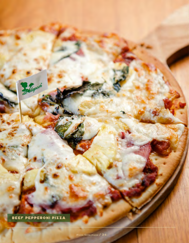
BEEF PEPPERONI PIZZA