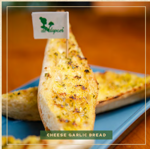
CHEESE GARLIC BREAD