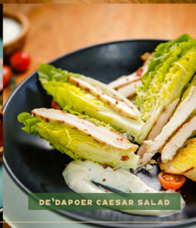
DE'DAPOER CAESAR SALAD