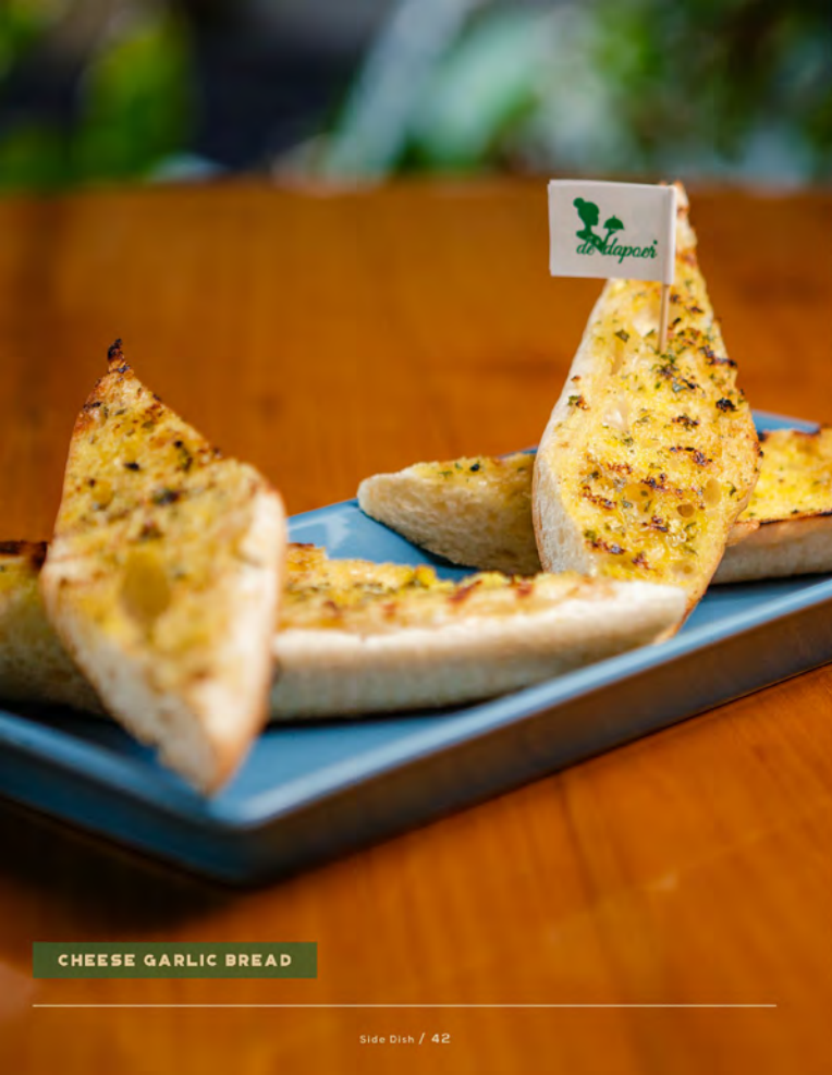
CHEESE GARLIC BREAD