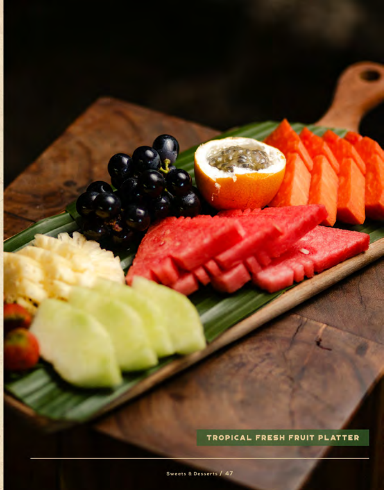
TROPICAL FRESH FRUIT PLATTER

A course that concludes a meal. The course usually consists of sweet foods, such as confections dishes or fruit or other savory items regarded as a separate course.